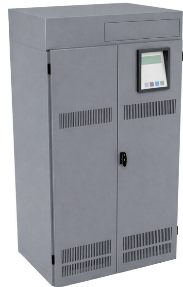
Cabinet depicted is 5kVA. Dimensions shown on chart.