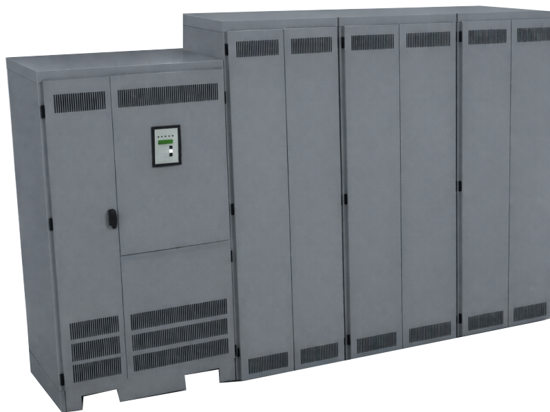
Cabinet depicted is 50kVA. Dimensions shown on chart.