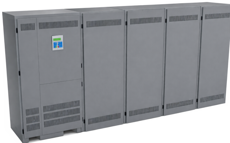
Cabinet depicted is 50kVA. Dimensions shown on chart.